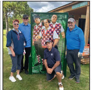
Greens Staff take their pictures with The Three Stooges during our staff golf event!